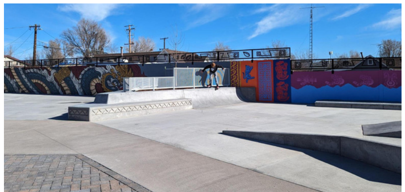
Skating features utilized by Denver youth