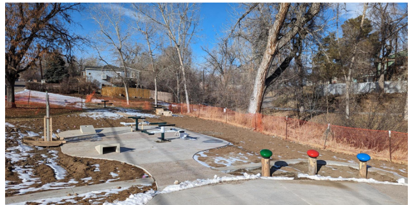
Nature play space with picnic area