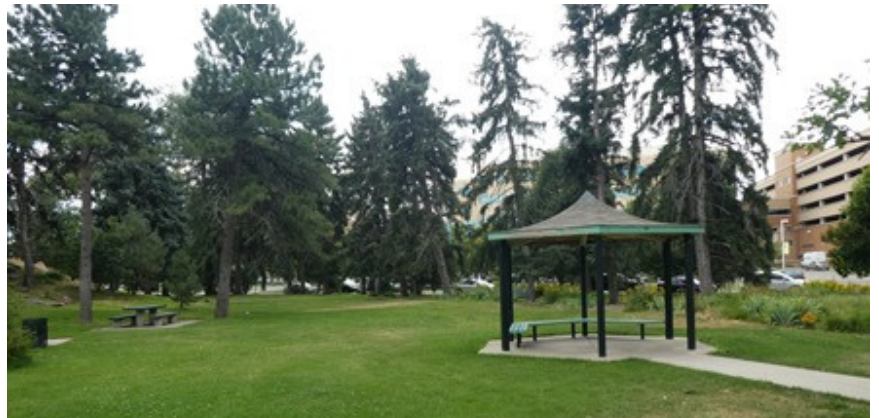
Existing Picnic Area

Lindsley Park is an "athletic priority park", due to its many courts and fields. The existing picnic area supports these priorities by providing shade and seating for spectators. This construction project will focus on improving this picnic area by upgrading the circulation and accessibility around the picnic site, as well as replacing the existing shelter. This project has become possible through the fundraising efforts of the Bellevue-Hale Neighborhood Association.