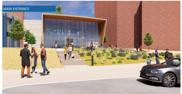
This rendering depicts the main entrance of the Theatre at Loretto Heights. It is anticipated the theater will open in 2028.

The Southwest Area Plan, that includes the part of the Mar Lee neighborhood that is in Council District 2, is in its final stage and will be wrapped up in February. Watch the councilman’s digital newsletter for details about the public hearing.