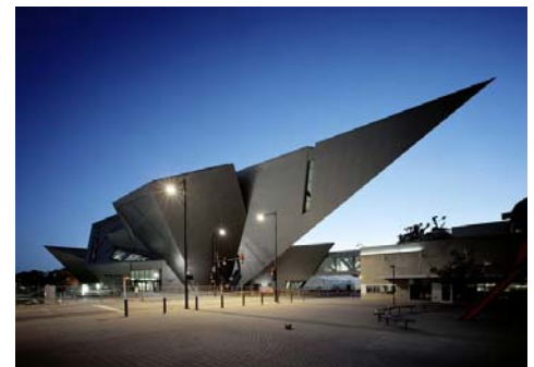
Denver Art Museum