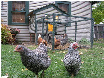
Backyard Chickens & Coop

On June 13th , the Denver City Council will hold a public hearing on the proposed changes to the Denver Zoning Code and the Animal Code to change the current allowances for Food Producing Animals (FPAs). Food Producing Animals include fowl (chickens, ducks) that produce eggs, and dwarf goats that produce milk.