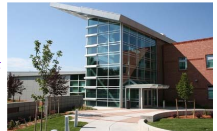
District 3 Denver Police Station

www.thescen3.org for SCFD Tier III events.