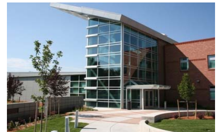
District 3 Denver Police Station

Find out what's happening throughout the Denver Metro Area for theater, arts, culture, sports and special events! Visit www.Denver365.com the online comprehensive event calendar or www.thescen3.org for SCFD Tier III events.