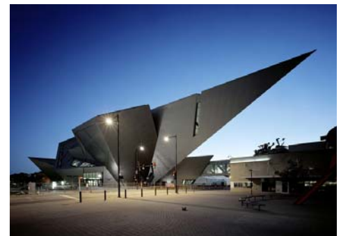
Denver Art Museum

Find out what's happening throughout the Denver Metro Area for theater, arts, culture, sports and special events! Visit www.Denver365.com the online comprehensive event calendar or www.thescen3.org for SCFD Tier III events.