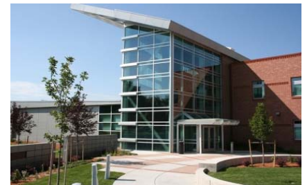
District 3 Denver Police Station

August 22nd & 28th 2001 Colorado Blvd 303-322-7009 www.dmns.org