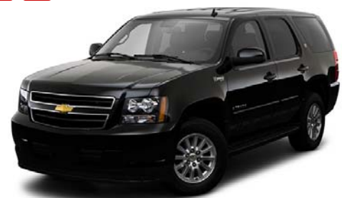
2008 CHEVY TAHOE HYBRID

Of the 450 General Motors cars and SUVs loaned to the DNC for the convention, 38 were yet to be rounded up, a week after the DNC ended, according to Paul Lhevine, chief operating officer for the Convention Host Committee. Some included SUVs similar to the one pictured, with a sticker price of more than $50,000.