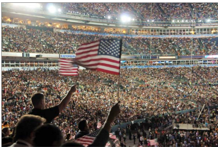
Thursday August 28 at INVESCO field at Mile High Stadium.

The broader economic impact of the DNC - the money spent by the estimated 50,000