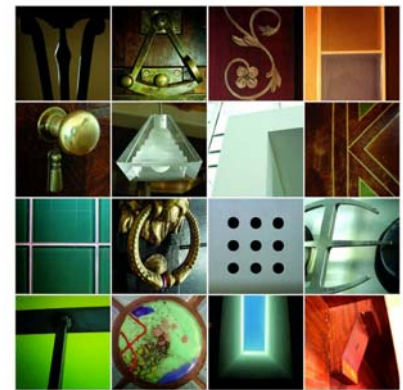
WASH PARK HOME TOUR

A community meeting will be scheduled in the coming weeks to present a more detailed overview of the project to neighboring residents and interested citizens.