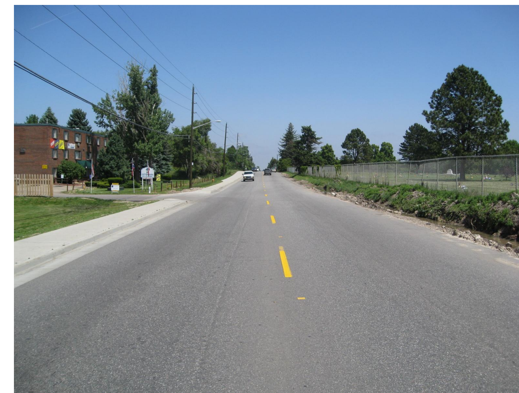
Quebec St north of Leetsdale Dr

• Improve North-South Multi Modal Mobility