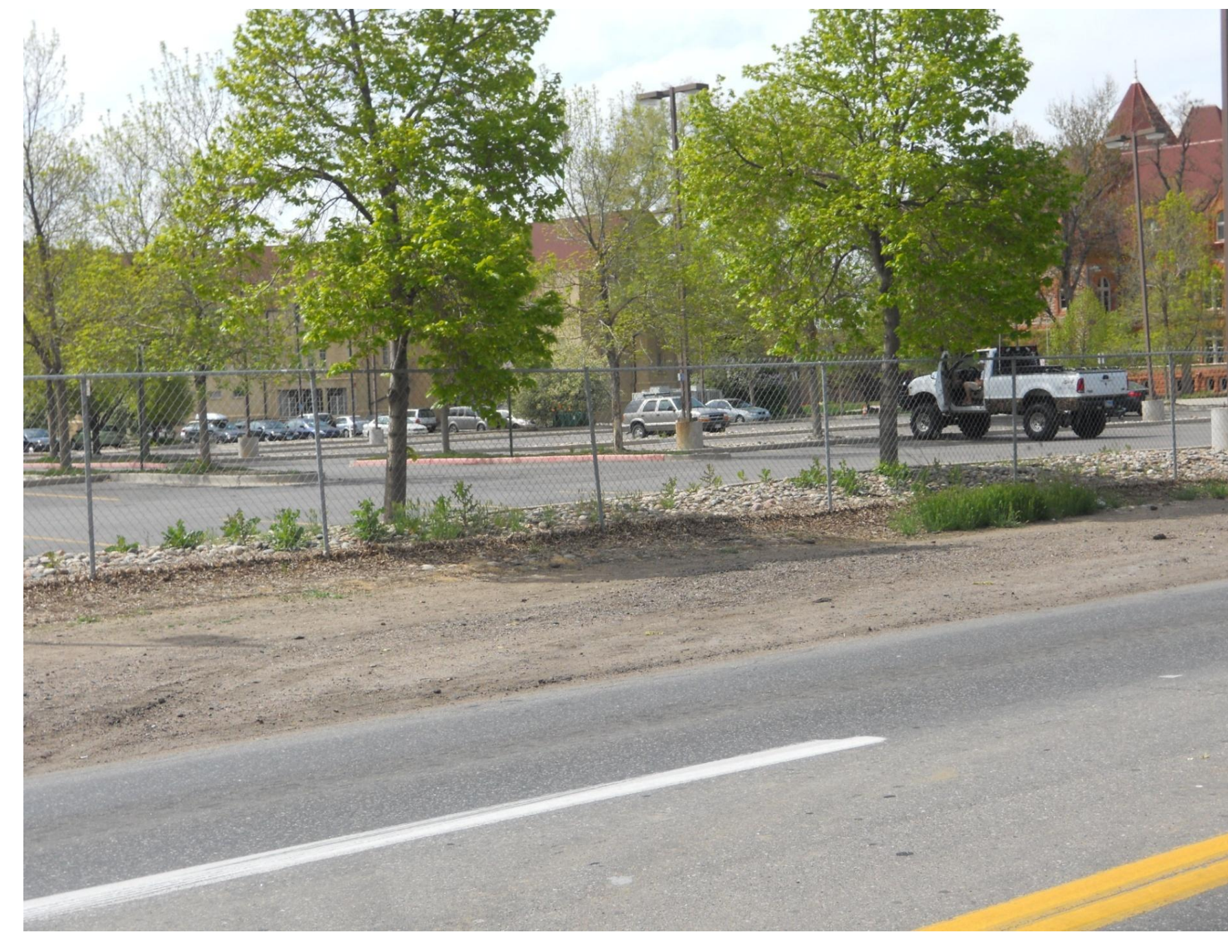
Lack of Roadside Drainage on Quebec St along Johnson & Wales University