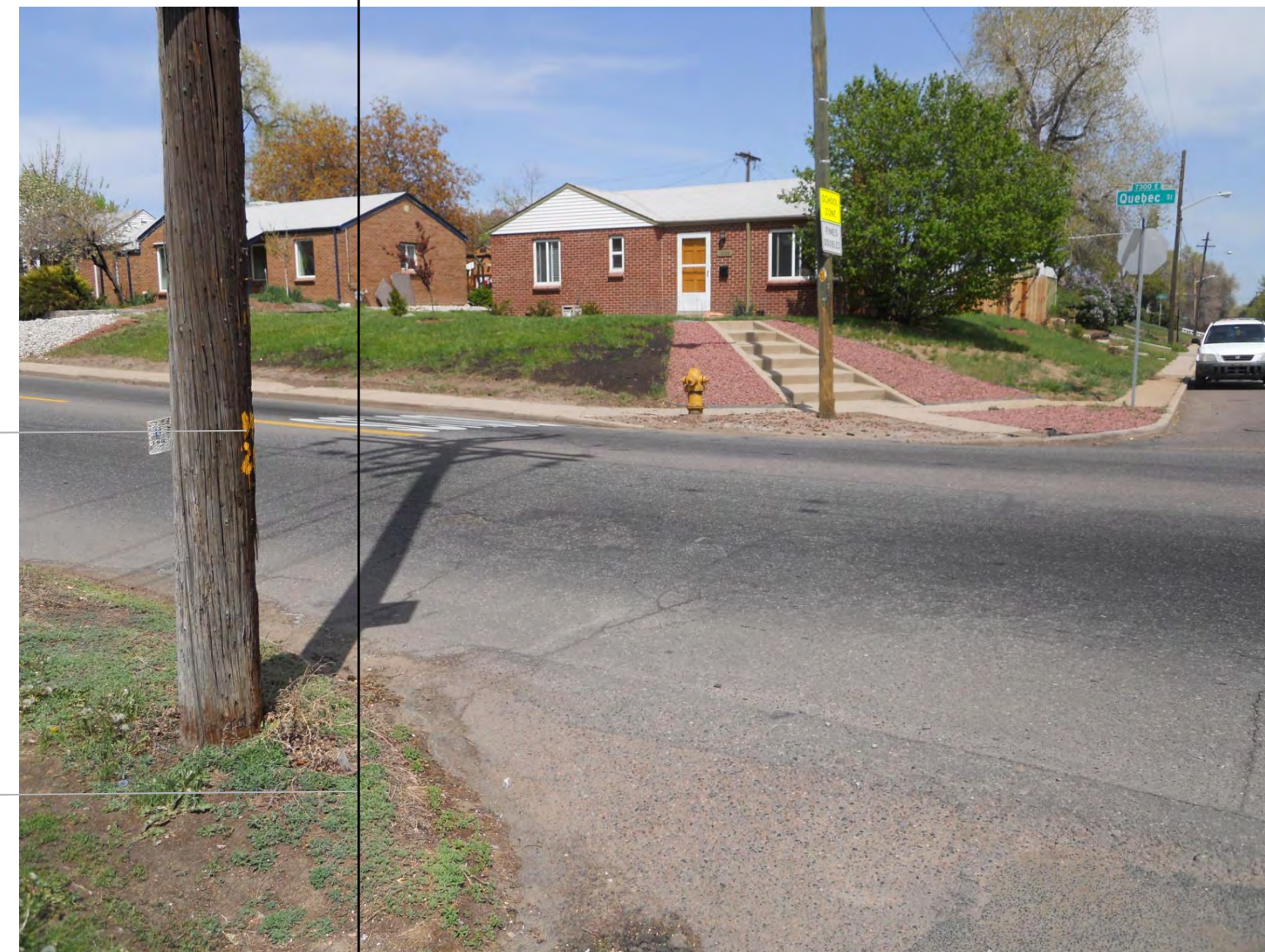
Pedestrian Crossing of Quebec St at 12 th Ave