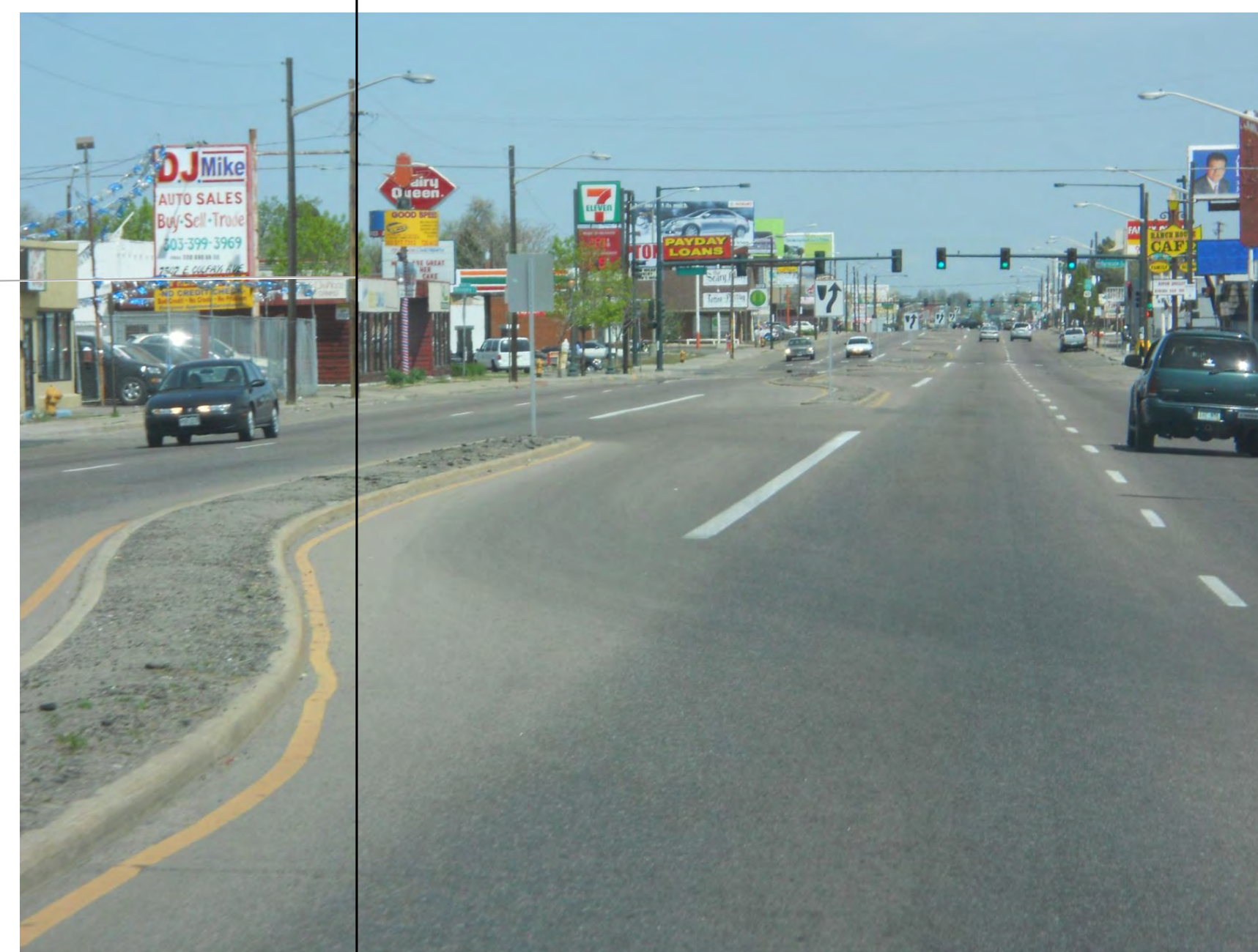
Colfax Ave between Signalized Pedestrian Crossings