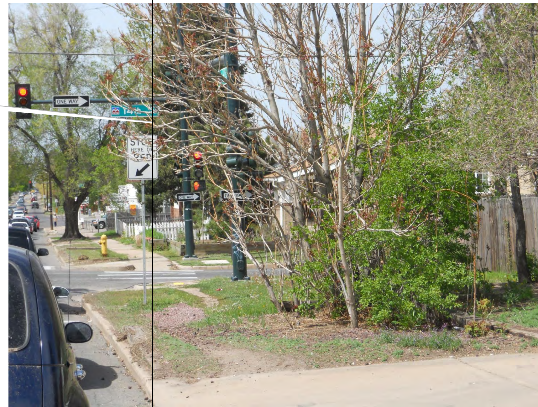
Missing Sidewalks along Quebec St at 14 th Ave