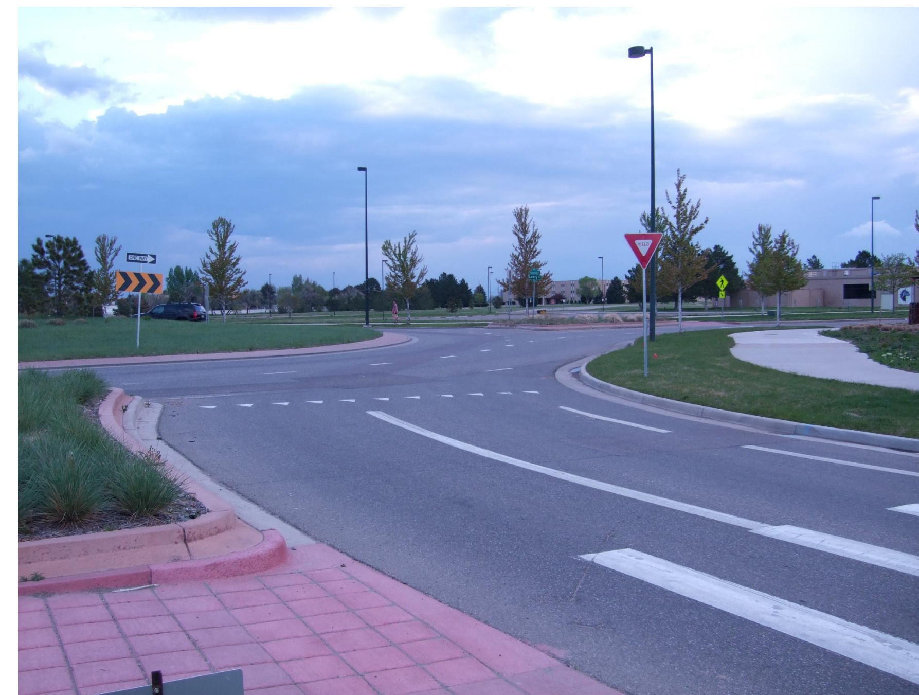
Roundabout on Yosemite St at Lowry Blvd