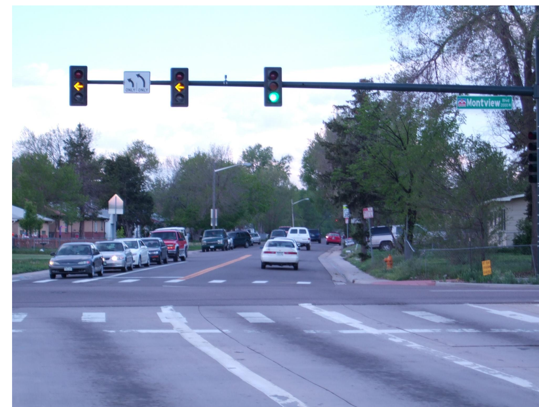
Lack of Designated Bike Lane on Yosemite St looking south of Montview Blvd

↕ Add Bike Lanes on MLK Jr Blvd *To be Completed by City, Spring 2010