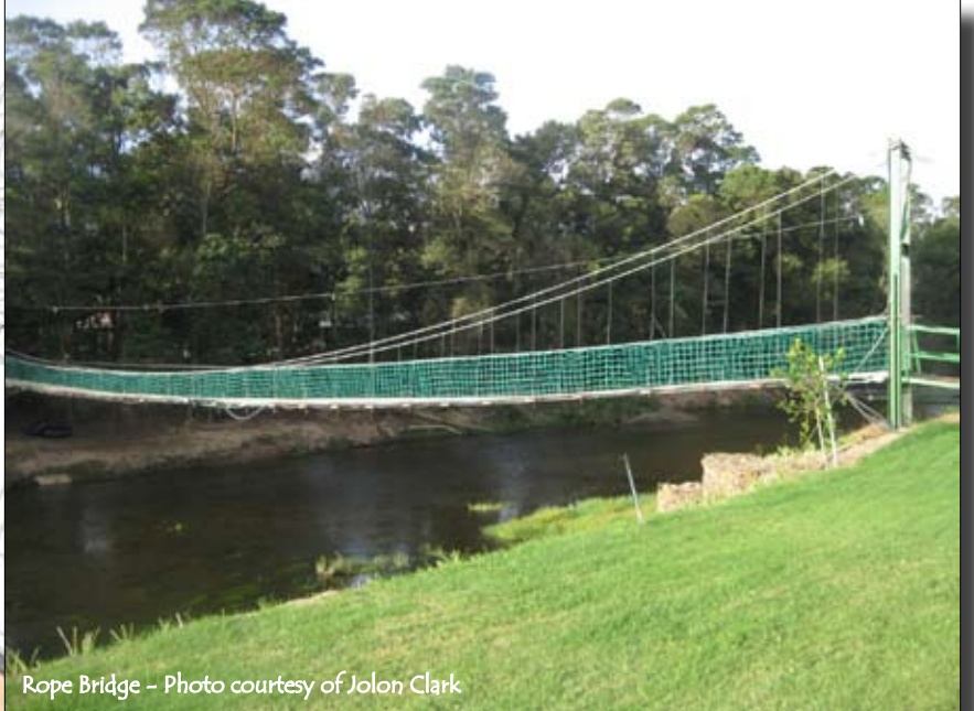
Rope Bridge