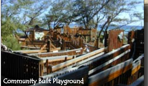
Community Built Playground