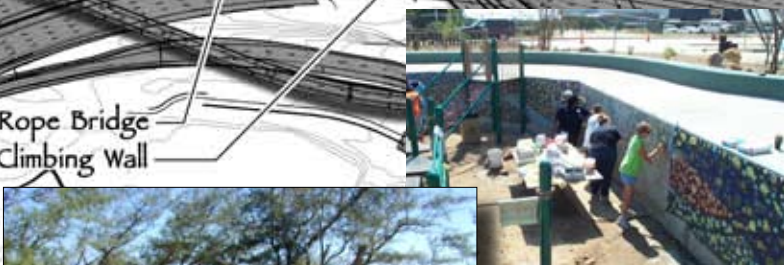
Rope Bridge Climbing Wall