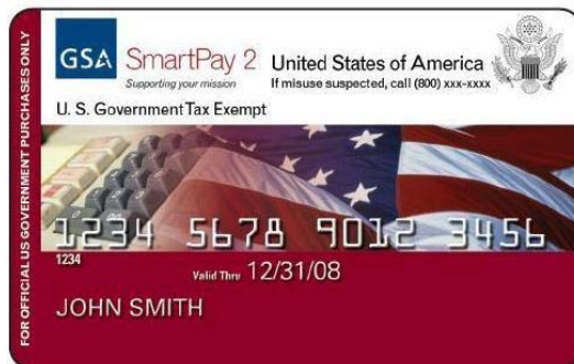
Purchase Card – Not Taxable