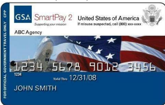
Travel Card – may or may not be taxable (see text)