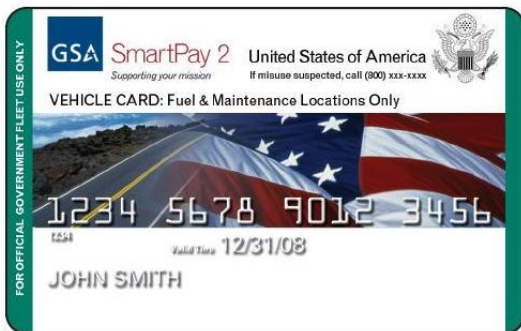
Fleet Card – Not Taxable