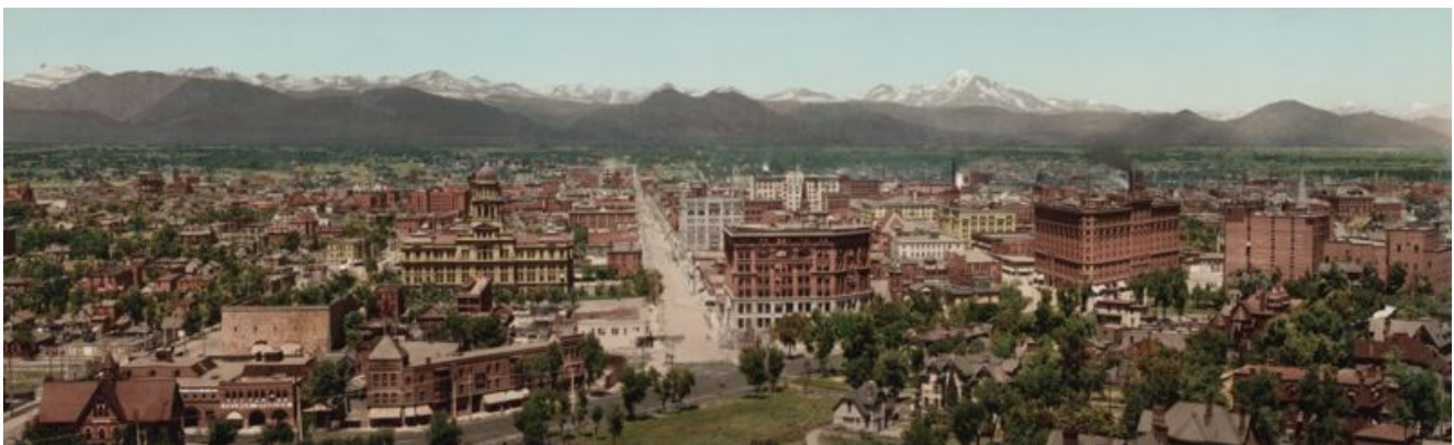
Denver Circa 1898

The center is located in the Wellington E. Webb Municipal Office Building atrium, 201 W. Colfax Ave. For more information, call 720.913.1715 or visit http://www.milehigh.com/business/business-assistance-center .