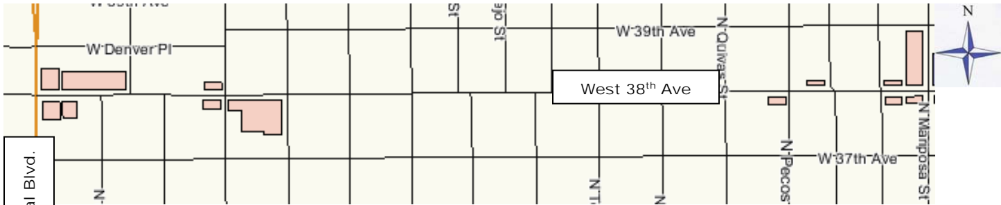
The District is located along portions of both sides of West 38 th Avenue between Federal Boulevard and Mariposa Street (shaded area).