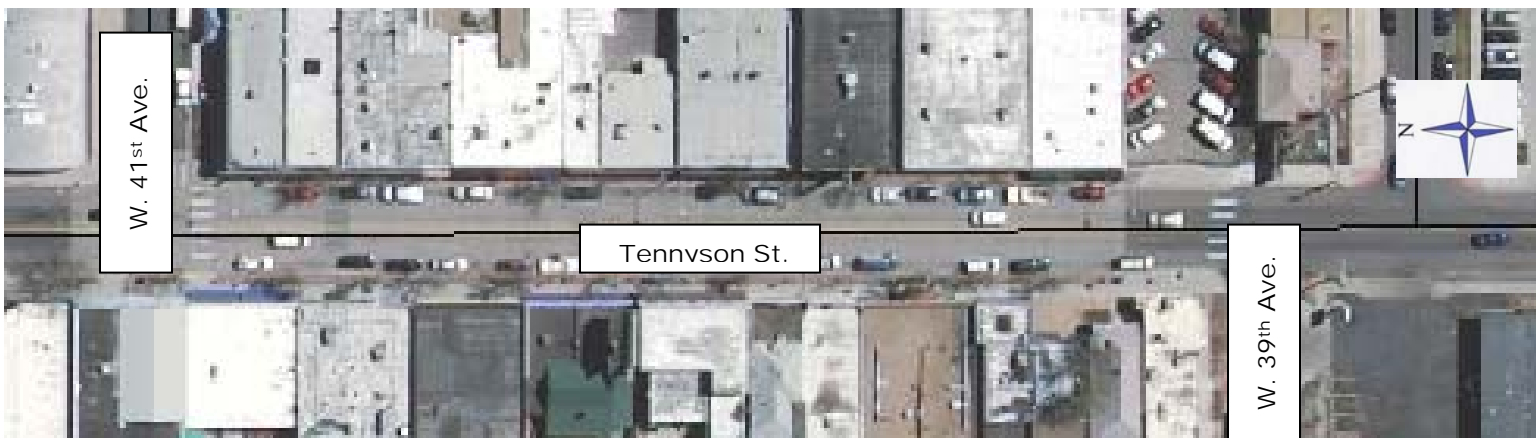
The District is located along both sides of Tennyson Street between West 39 th Avenue and West 41 st Avenue