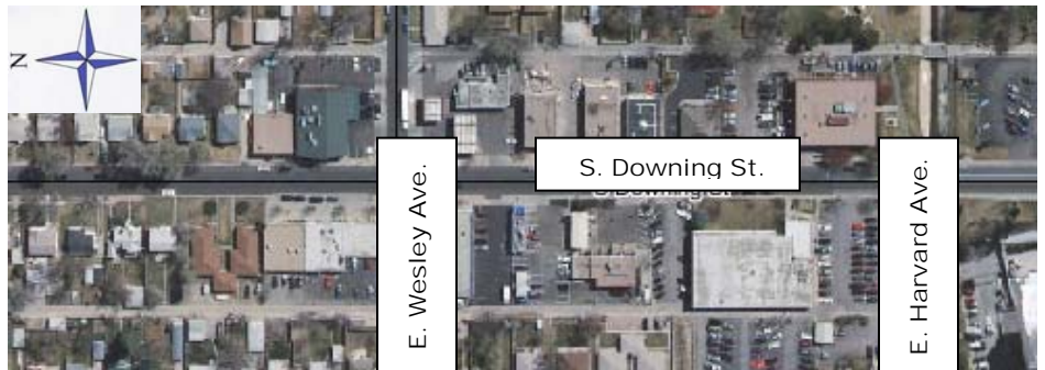
The District is located along both sides of South Downing Street between East Harvard Avenue and approximately 200 feet north of the South Downing Street and East Wesley Avenue intersection