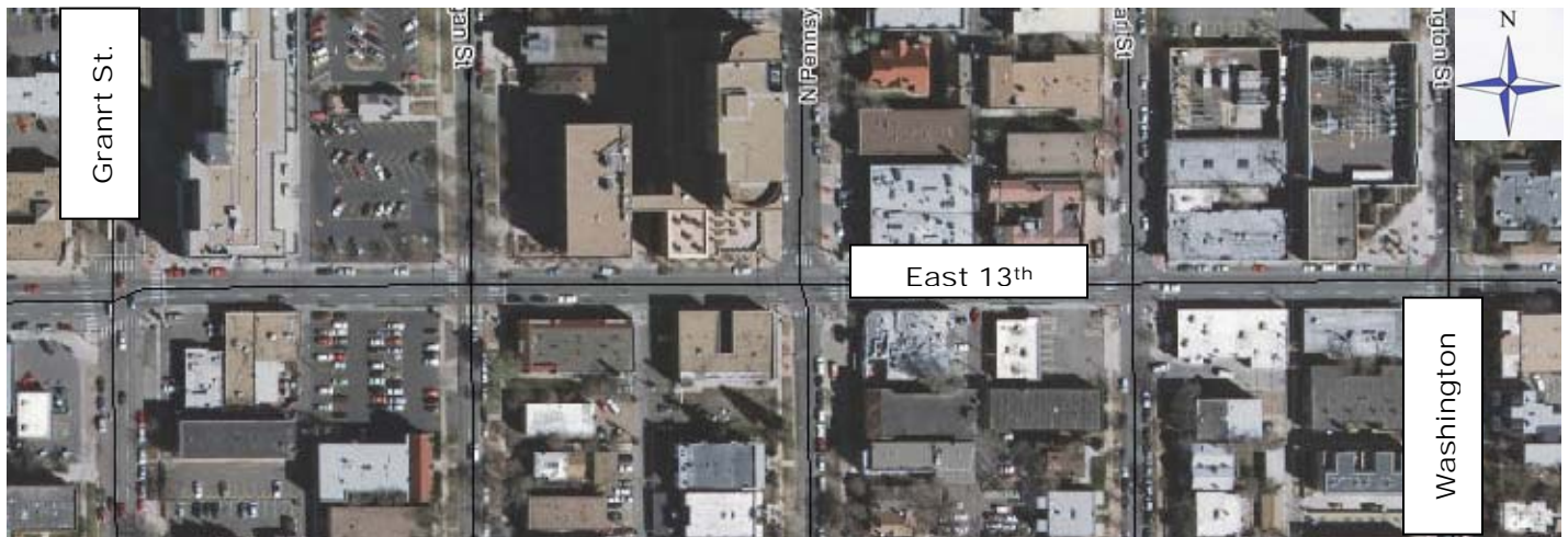
The District is located along both sides of East 13 th Street between Grant Street and Washington Street