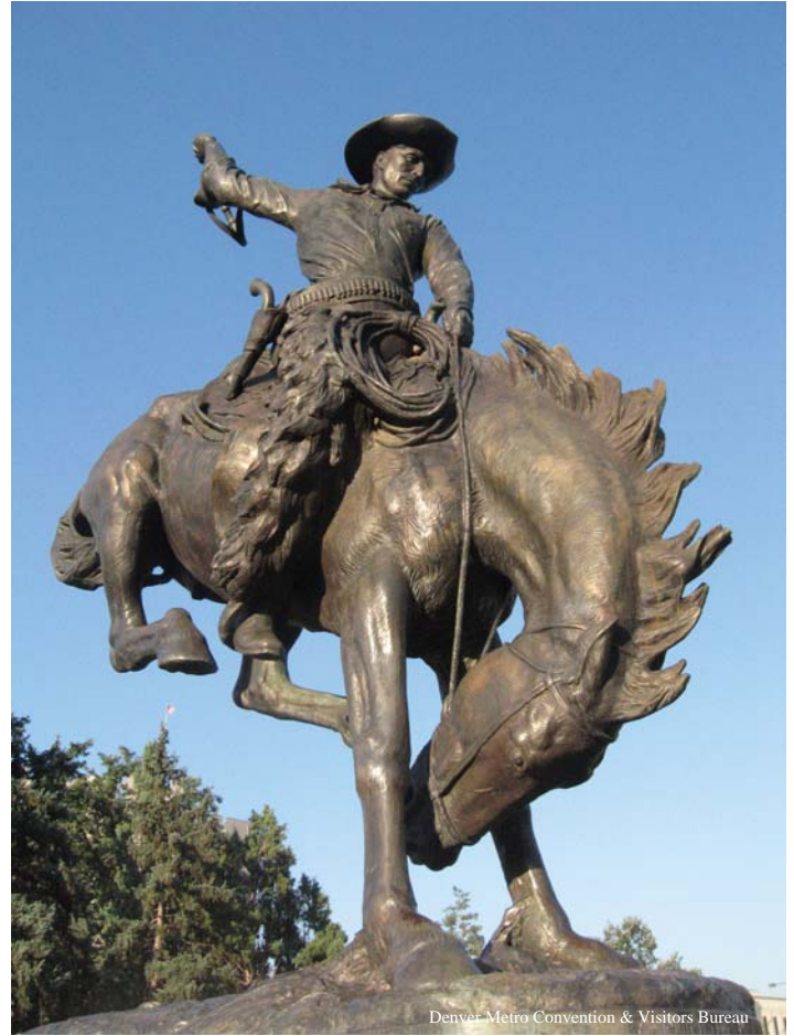
Denver Metro Convention & Visitors Bureau

The Santa Fe “C” Local Maintenance District is located along both sides of North Santa Fe Drive between West 6 th Avenue and West 5 th Avenue. This District was established by City Ordinance in 2002 for the maintenance and continuing care of streetscape features that exist within the District. These streetscape features may include trees, irrigation, decorative pedestrian lights, sidewalk, benches and trash receptacles. A District Board of Directors represents the interests of the District and the property owners. The Board develops an annual budget for the cost of maintaining the District. Property owners within the District are then annually assessed based on the proportion of their front footage to the total front footage of property within the District.