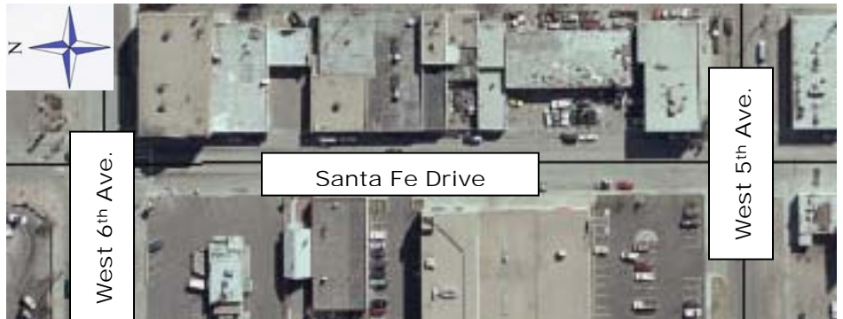
The District is located along both sides of Santa Fe Drive between West 6 th Avenue and West 5 th Avenue