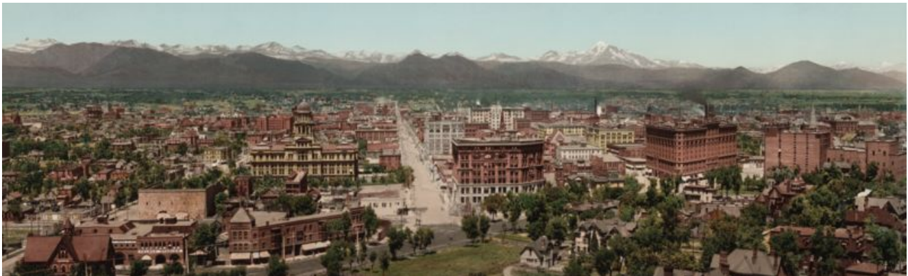
Denver Circa 1898

The center is located in the Wellington E. Webb Municipal Office Building atrium, 201 W. Colfax Ave. For more information, call 720.913.1715 or visit http://www.milehigh.com/business/business-assistance-center .