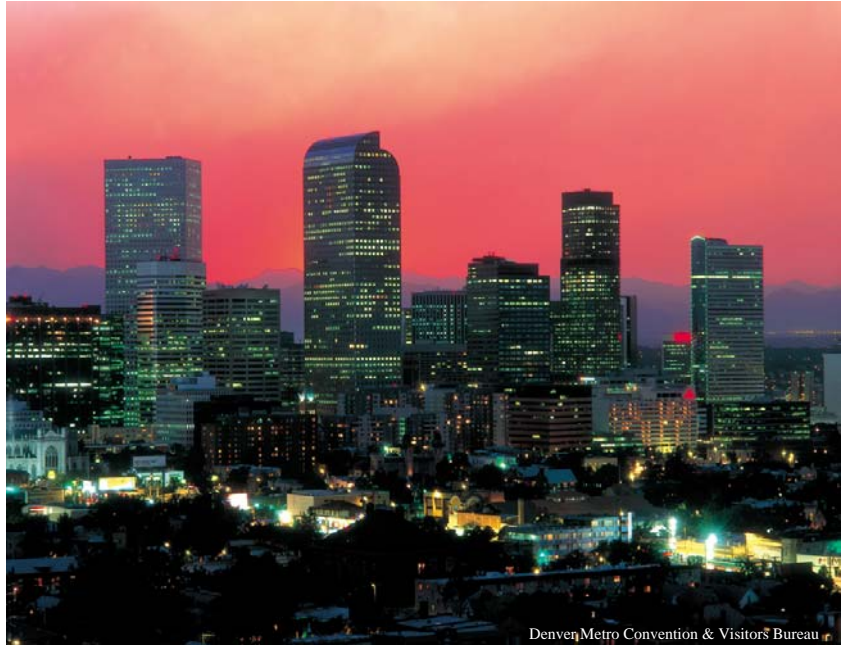
Denver Metro Convention & Visitors Bureau

The Consolidated Larimer Street Local Maintenance District is located along both sides of Larimer Street between 20 th Street and Park Avenue West. This District was established by City Ordinance in 1997 for the maintenance and continuing care of streetscape features that exist within the District. These streetscape features may include trees, irrigation, decorative pedestrian lights, sidewalk, benches and trash receptacles. A District Board of Directors represents the interests of the District and the property owners. The Board develops an annual budget for the cost of maintaining the District. Property owners within the District are then annually assessed based on the proportion of their front footage to the total front footage of property within the District.