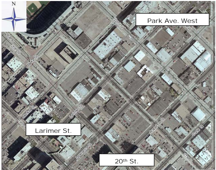
The District is located along both sides of Larimer Street between 20 th Street and Park Avenue West