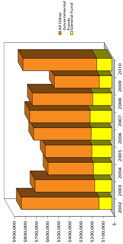
Fund Balances of Governmental Funds