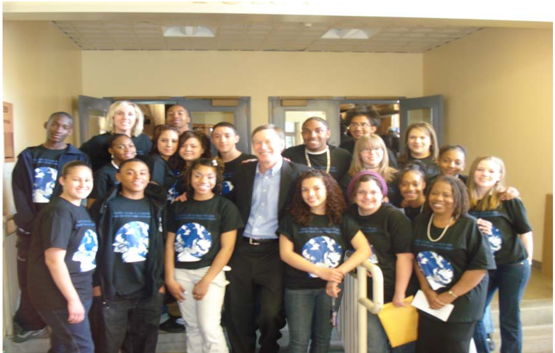
above: Mayor John Hickenlooper and SCYLT Team

Mayor John Hickenlooper started off the day by motivating youth to be involved in their community and to use their voice! The workshops were interactive and it got youth excited to discuss issues they face in their community and schools. Youth were given the chance to address local officials with concerns, ideas, and questions they have regarding issues related to youth. We had over 500 youth attend the conference from the Metro Denver area.