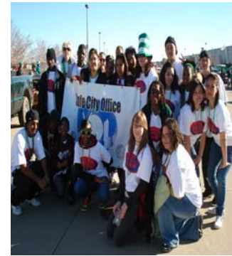
St. Patrick's Day Parade 2009