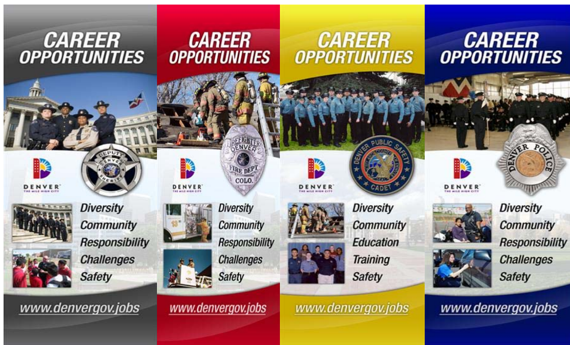
Photo: Display banners for community outreach and recruitment events 2008