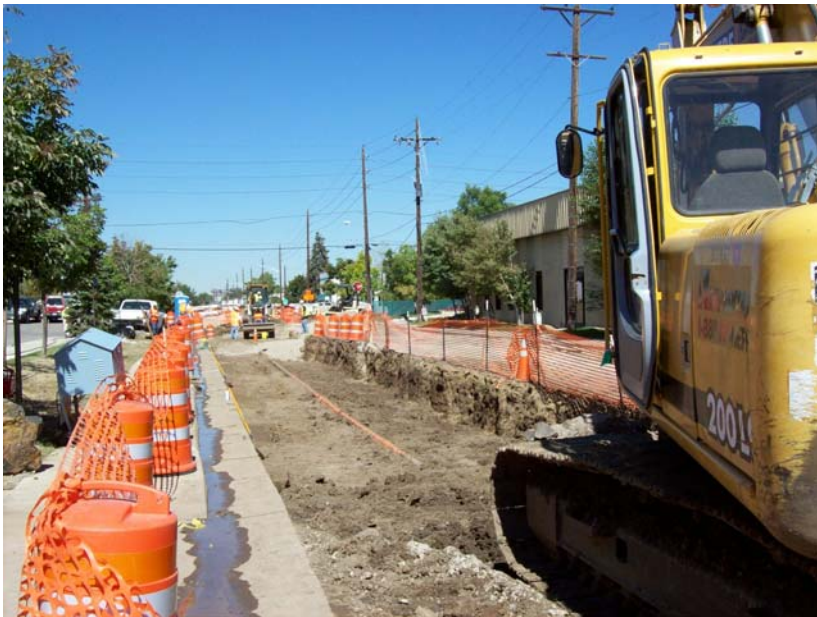
Excavation zone along Phase 1 and Phase 2 of West lane.