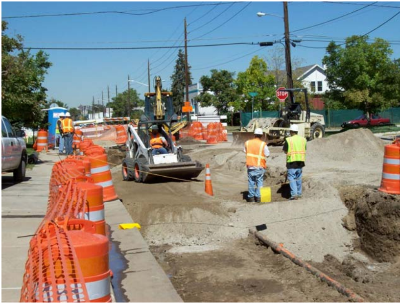
Rebuilding driveway access to North West businesses.