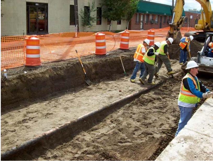
Excavation of impacted material around gas line.